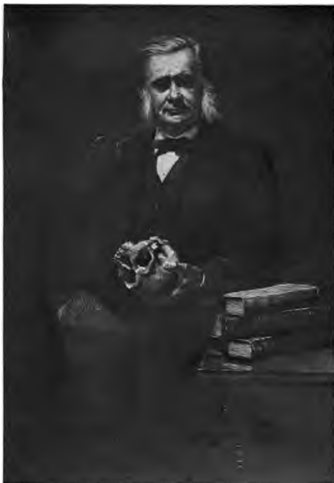
Thomas H. Huxley